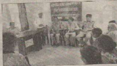
कार्यवाही में विगत १९८० प्रमाण

संघटन के तत्वावधान में ईद मिलान कार्यक्रम का आयोजन किया गया। इसमें भी एकता और सांघिकी सोझा फलम रखने की अपील कसरी हुइ, समिन्ना कार्यक्रमों का आयोजन किया गया। कार्यक्रम में नगर पंचायत संघामिन्ना जवकल कुर्शी नुकी के लोहारों का मनना घडि भई कसरी डेर मजबूत करी के। विगारी ने कहा कि ईद के लोहार पूत मुखलम भा एक मह न ई और समकिये दसह न