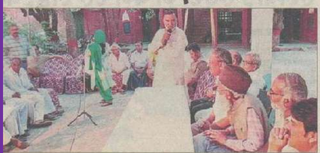
देशा संरक्ष्य द्वारा आयोजित रोजा इन्टर कंट्रक गे शामिल लोग।

टेडा। मुन्तापुर के दिशा समाजिक मिशन द्वारा गाँव रंगनाथ में रोज़ा पम्पन दिशा का जलसेवन किया गया।